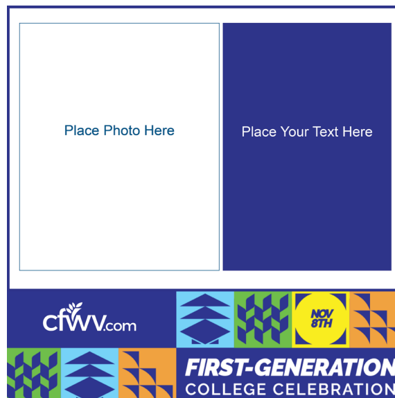
900x900 Shareable Image