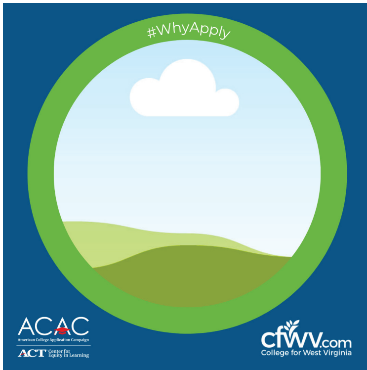
#WHYAPPLY Add Your Own Picture Template #2